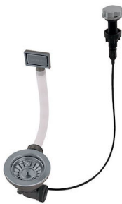
Gun Metal automatic waste fitting 8407 110