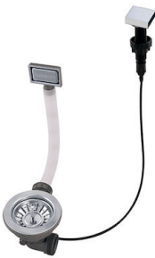
Automatic waste fitting 8407 113