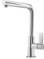
Mixer Tap Omega 8497 000