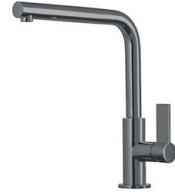
Mixer Tap Omega Gun Metal 8497 856