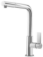
Mixer Tap Omega Plus 8497 020