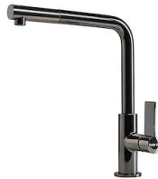
Mixer Tap Omega Plus Gun Metal 8498 856